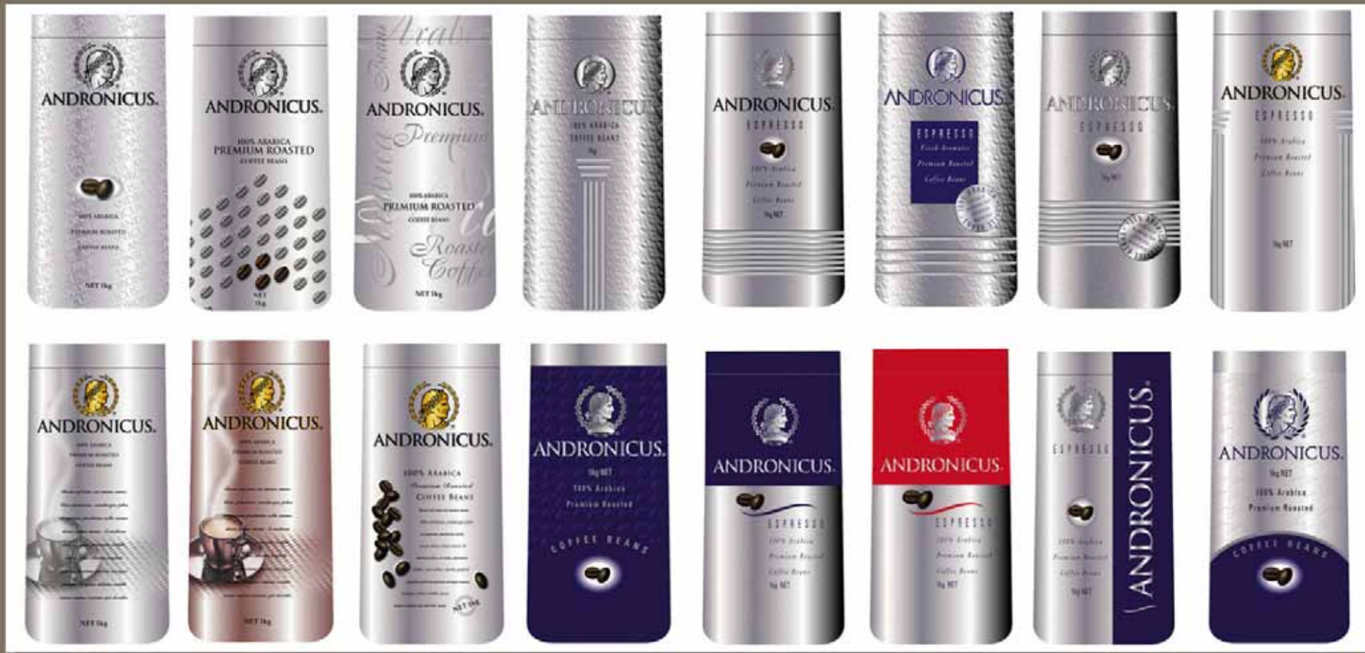
Design Concepts Stage 1