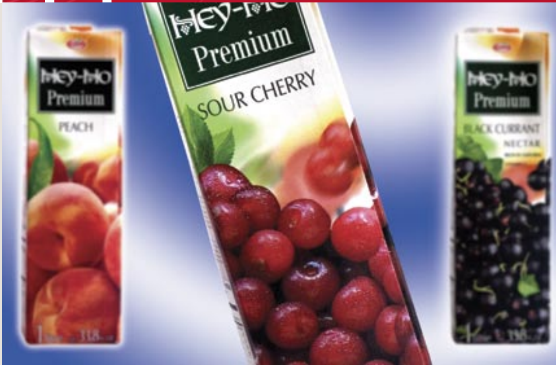
Above right: Hey-Ho Premium Juice cartons x 3 flavours