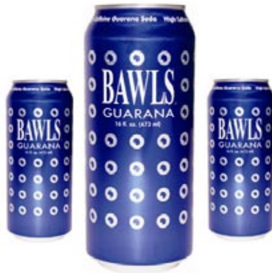
Right: BAWLS can energy drink with unique surface.

Welcome to All About Packaging which we distribute to our associates, friends, clients and partners who share our passion in packaging. If you think that anyone you know might get some value out of reading AAP , please feel free to pass it on, and equally if you prefer not to receive our updates please let us know.