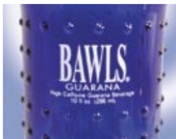
Below: Close up of unique can BAWLS energy drink.