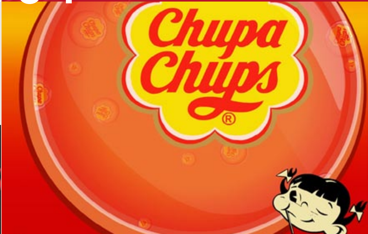
The Chupa Chups Logo was designed by Salvador Dali in 1968